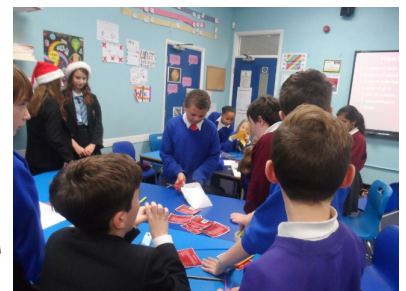
Working together as a team with the children from the other Catholic schools